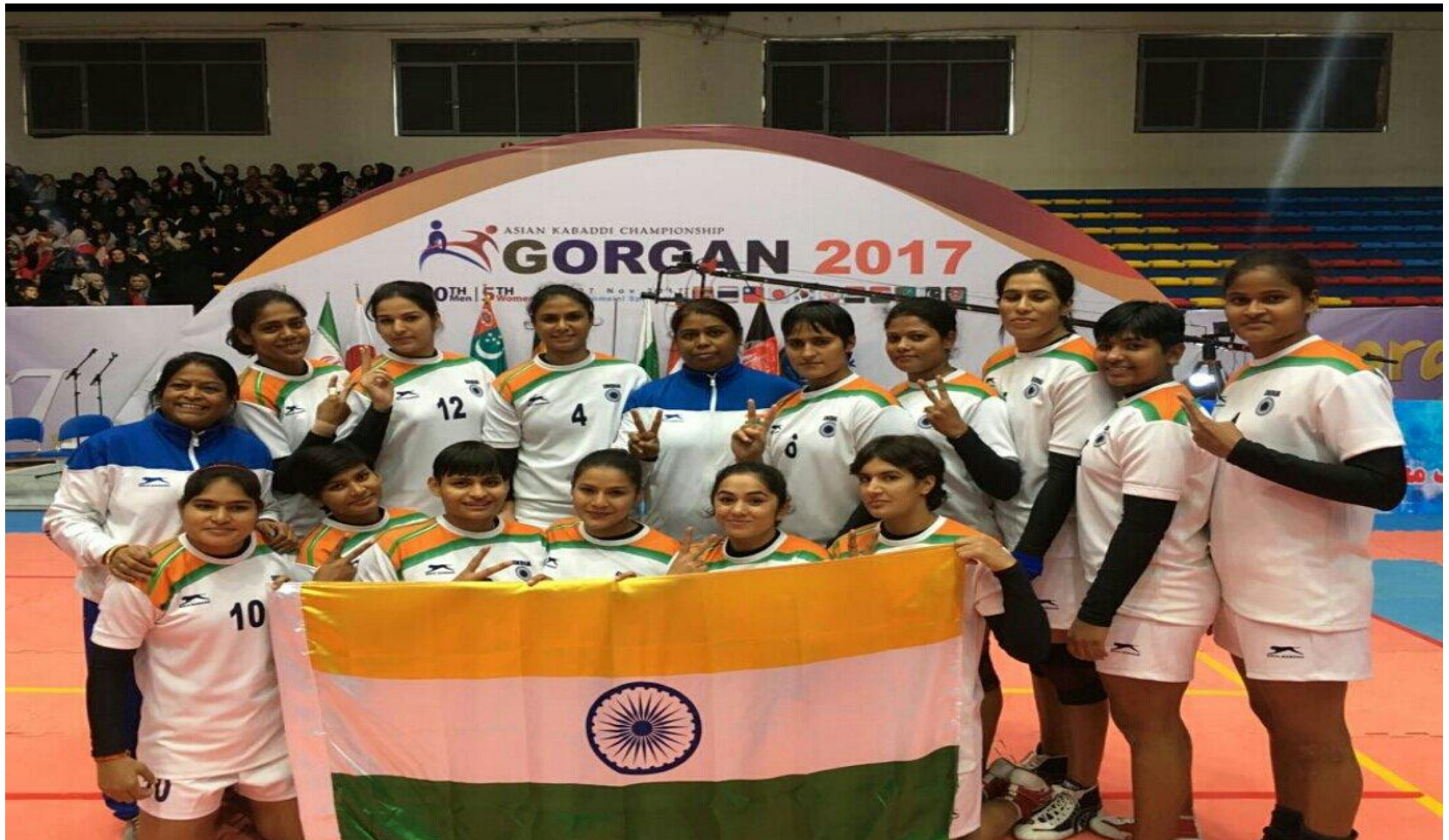
Asian Kabaddi Championship – 2017. (Place- Gorgan)