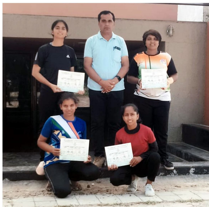
Gujarat University Inter College, Wrestling Runners-up (2022-23)