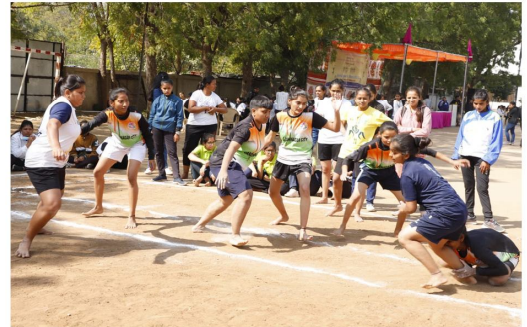
Inter College, Kabbadi Champion (2022-23)