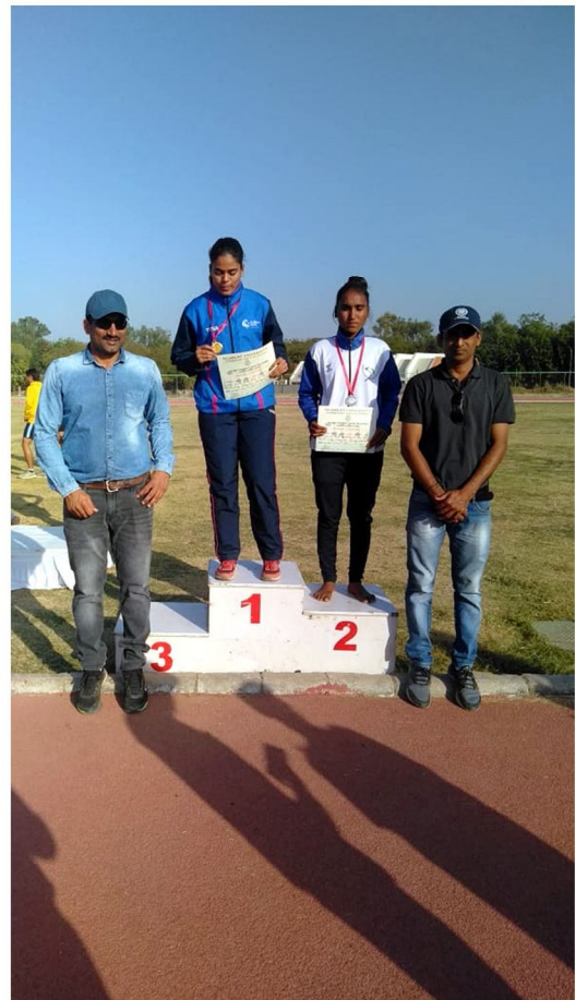
Gujarat University Inter College, Athletics (2022-23)