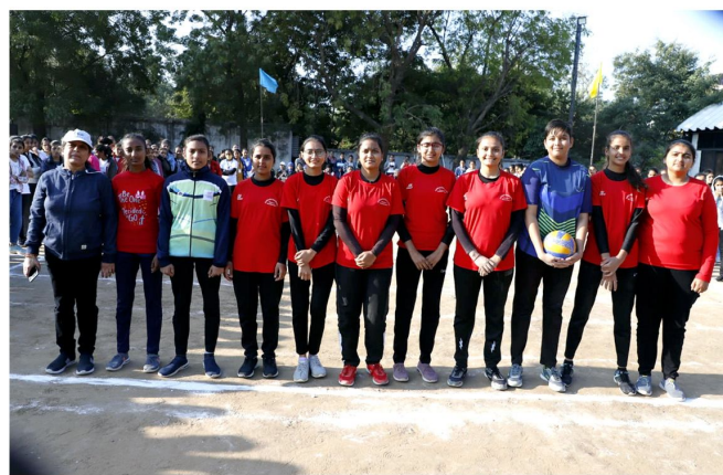
Inter College, VolleyBall Champion (2022-23)