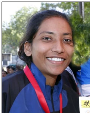
Solanki Tanu Game-Kabbadi Date-22 to 25/01/2023 Place-Kutch-Bhuj (Guj.)