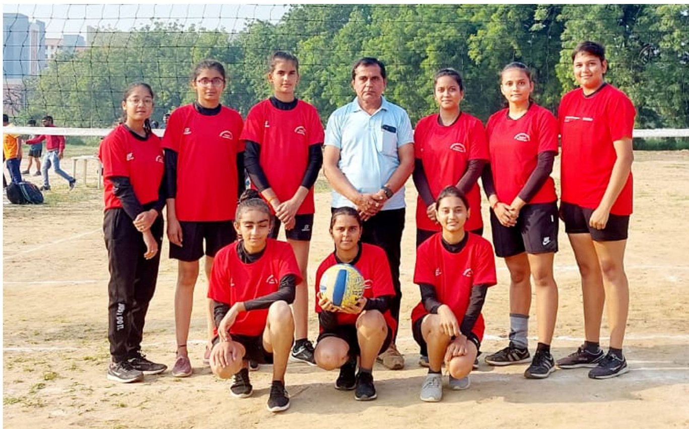
Gujarat University Inter College, VolleyBall (2022-23)