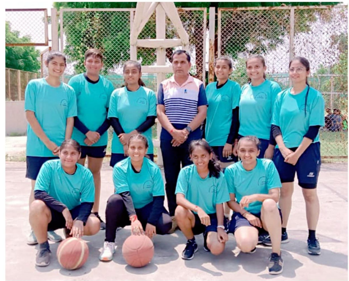
Gujarat University Inter College, Basketball Runners-up (2022-23)