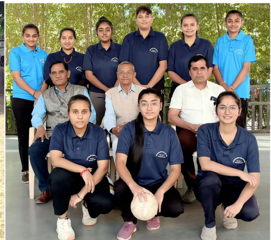
Gujarat University Inter College, Handball Champion 2022-23