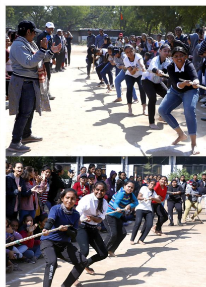
Inter College, Tug of War Champion (2022-23)