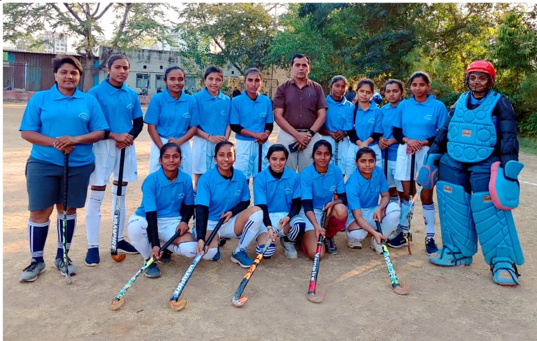
Gujarat University Inter College, Hockey (2022-23)